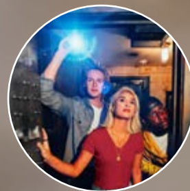
THE ESCAPE GAME